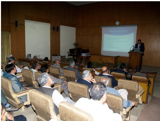
Seminar in NIAB Faisalabad